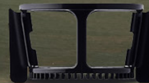
POM Brush holder Silicone Brush

Bacteria Free Using Stainless Durable and Harm Free Ultem