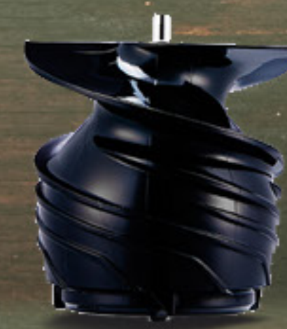
PEI [Ultem] Ultem Squeezing Screw

Chemical resistance, friction & wear resistance Usually used in Thermos and Toys.