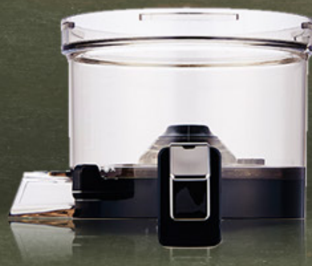
Tritan Chamber BPA Free Plastic, Tritan

It is not manufactured with bisphenol A(BPA) or other bisphenols, such as BPS.